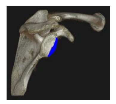
Figure 1: A 3D CT reconstruction of the scapula. The blue segment illustrates the bony deficit of the glenoid.

When bony lesions reach critical dimensions, reconstruction of this deficit using autograft bone yields the best surgical results. The Latarjet procedure is the most popular and highly effective, transferring the distal coracoid into the bony defect.<sup>3</sup>